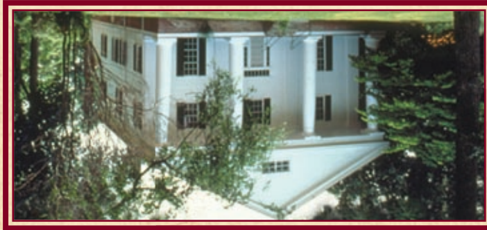
The Bullochs - Glimpse a Presidential past... A Love Story and so much more

Bulloch Hall, 1839 180 Bulloch Avenue - 770-992-1731