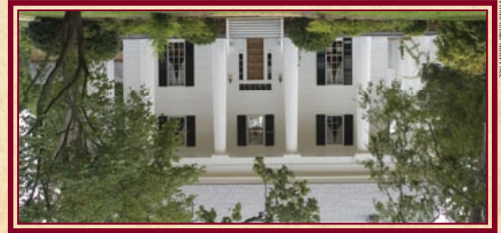
The Kings - Roswell's Founding Family Experience a Bold Inspiration:

Barrington Hall, 1842 535 Barrington Drive - 770-640-3855