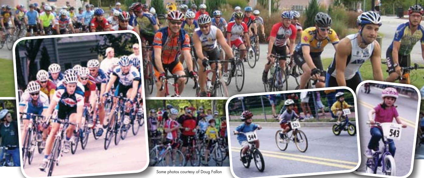
Some photos courtesy of Doug Fallon